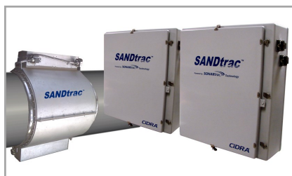
SONARtrac, SANDtrac and CiDRA are trademarks of CiDRA.